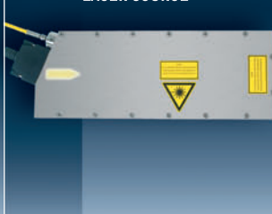
OEM - LASER SOURCE